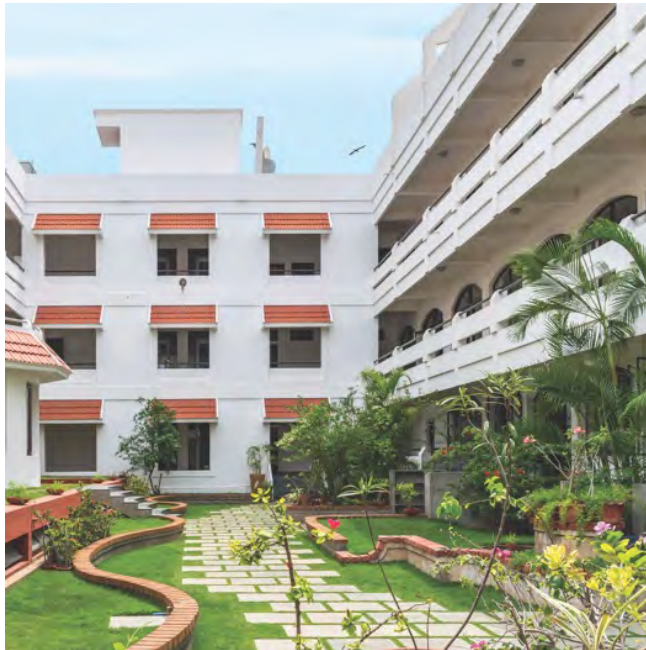
International Headquarters of Sri Aurobindo Society, Puducherry