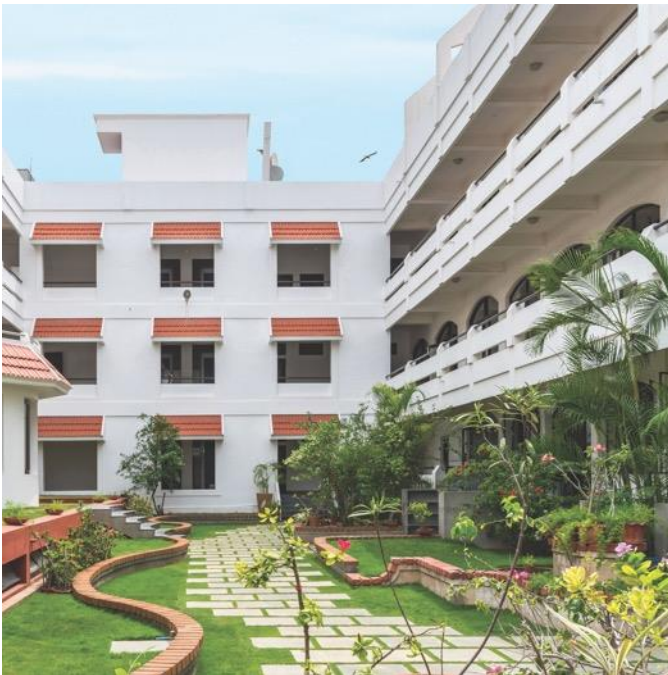
International Headquarters of Sri Aurobindo Society, Puducherry